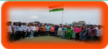
Unit Udyog Vihar 219