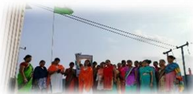
Unit Udyog Vihar 227