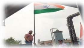
Unit Udyog Vihar 151