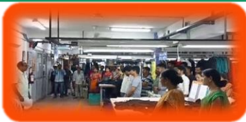
Unit Udyog Vihar 294