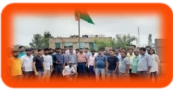
Unit Udyog Vihar 149