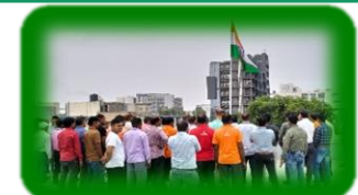
Unit Udyog Vihar 418