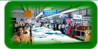
Unit Udyog Vihar 232