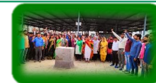
Unit Noida 33-34