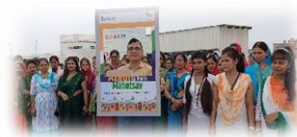
Unit Manesar 427