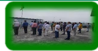
Unit Manesar 181