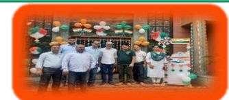
Unit Noida 49-50