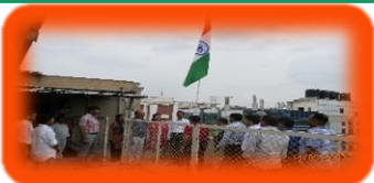
Unit ABC Leathers