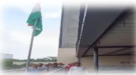
Unit Udyog Vihar 871