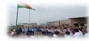
Unit Noida 53-54