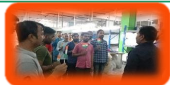
Unit Manesar 407