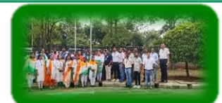
Unit Jigani (Bangalore)

76 th Indian Independence Day (Azadi ka Amrit Mahotsav) was celebrated in all factories of Richa Global. The event was celebrated on 14 th August at 11:00 am with hoisting of National Flag and singing of National Anthem by all the factory employees (approx. 20,000 nos.) at one time. Factories were decorated with Tricolours. The sound of our National Anthem developed wave of excitement and patriotism in the air.