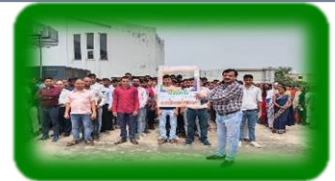
Unit Udyog Vihar 215