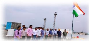
Unit Manesar 166